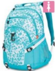
Item #: 53648 Tropic Leopard, Tropic Teal, White