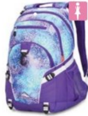
Item #: 54532 Flower Daze, Purple, White