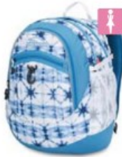
Item #: 44947 Indigo Dya, Mineral, White