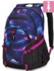
Item #: 84635 Cosmos, Black, Razzmatazz