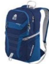
Item #: 55019 Midnight Blue, Blue, Chromium