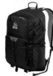
Item #: 58001 Black