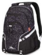
Item #: 63584 Black, Speckly, White