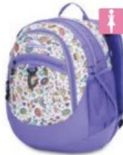
Item #: 45204 Sweet Cakes, Lavender