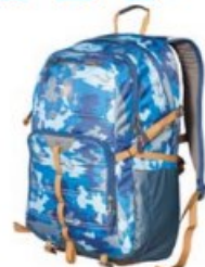
Item #: 58020 Surf Camo, Midnight Blue, Bourbon