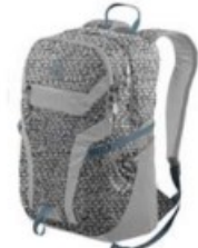
Item #: 55010 Alt Jay, Chromium, Rodin