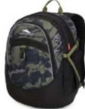
Item #: 46845 Kamo, Black, Moss